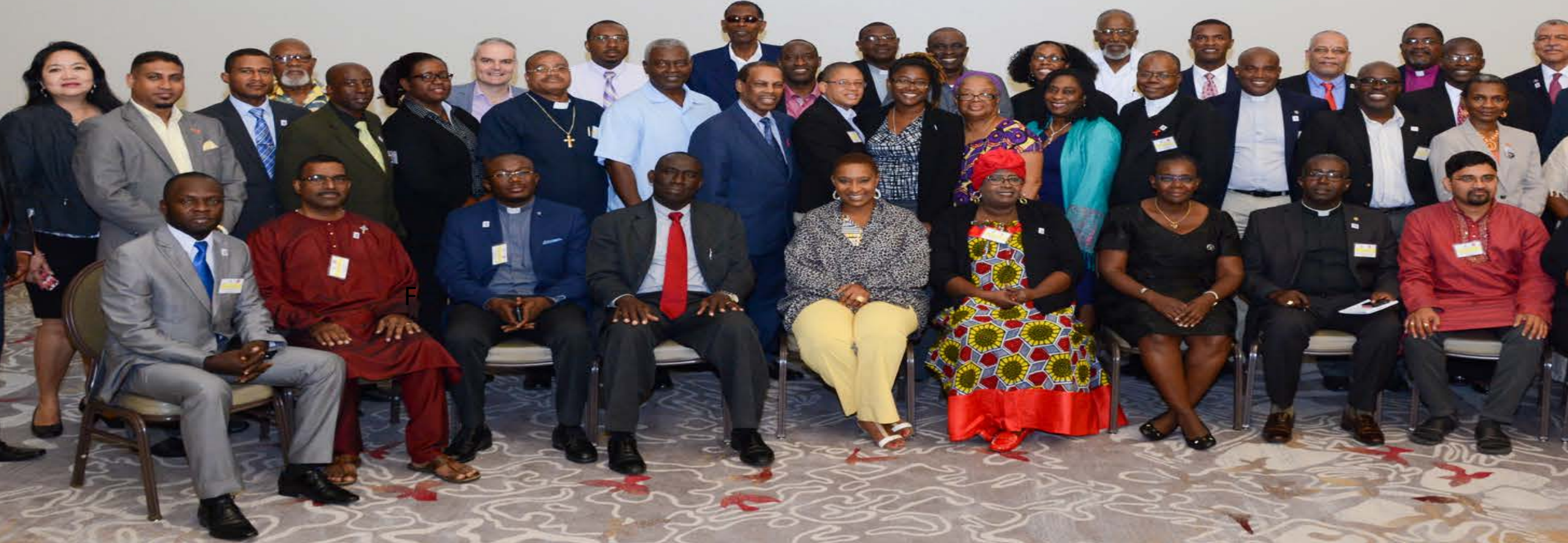
Strategic Stakeholder outcome : Faith Leaders Consultation [Feb 2017] Recommend Meeting with representatives of LGBTI to discuss formula for ending AIDS in Caribbean.