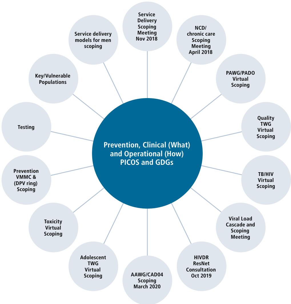
Fig. A.1 Hub-and-spoke model for technical scoping conducted for the guidelines update

Several technical scoping meetings were held to formulate the population, intervention, comparison and outcome (PICO) questions relevant to this guideline document as well as from research gaps highlighted from previous guideline meetings. Table A2 summarizes these activities.