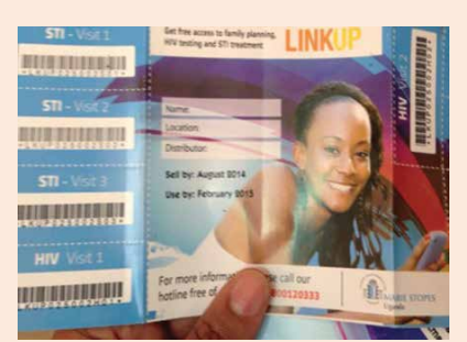
Link Up youth voucher for HIV and SRH services.

partner facilities for HIV and SRHR counselling and services. The vouchers were designed with input from young Ugandans to accomplish three goals: 1) generate demand for services by being attractive and