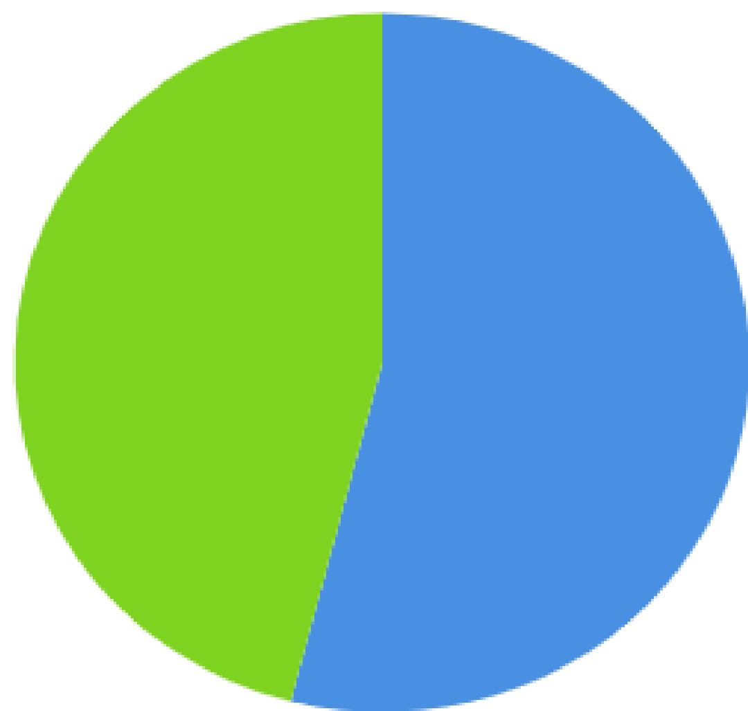
Births per 1000 teen girls

Almost half of Caribbean young people from eight countries do NOT demonstrate accurate knowledge about HIV prevention and transmission