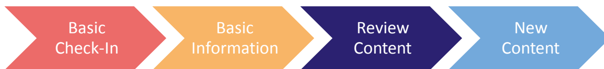
Figure: Continuum of Virtual DREAMS Content Delivery

Contact should focus on keeping AGYW engaged with her mentor and peers, providing referrals for time sensitive services, e.g. GBV response, FP, and PrEP. In addition, IPs should deliver information ranging from basic check-ins to delivering some material from curriculum-based interventions (see Figure below). At this time, DREAMS IPs should NOT be delivering full curriculum-based interventions in a virtual format. This means that AGYW who need to complete one or more curriculum-based intervention(s) in order to complete the DREAMS program will not be able to complete the intervention of the DREAMS primary package at this time. For additional detail on content that can be delivered at each point in this continuum, see new Virtual Delivery of DREAMS Content During COVID-19 document on the DREAMS SharePoint site.