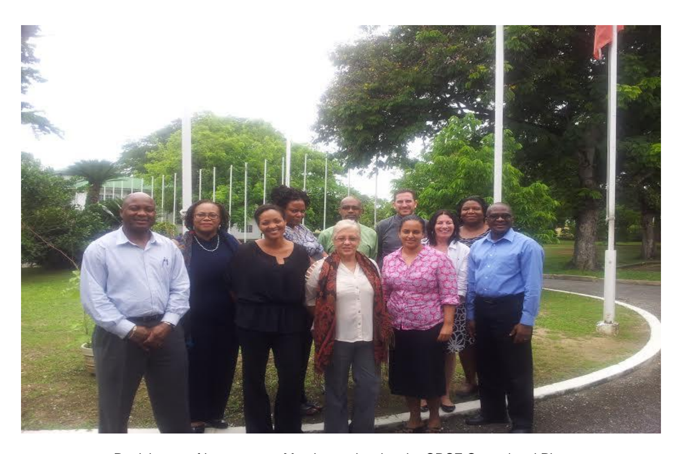
Participants of key partners Meeting to develop the CRSF Operational Plan