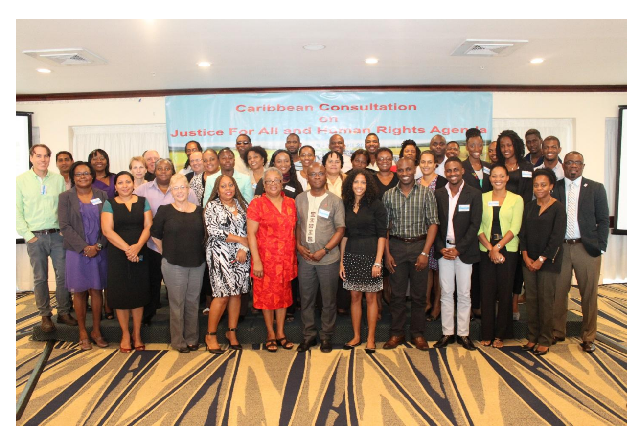
Participants at the PANCAP Regional Consultation on Justice for All and Human Rights Agenda

This document describes the Caribbean Regional Strategic Framework 2014-2018. Section Two describes the PANCAP regional response to date, highlighting key achievements, challenges and gaps. Section Three presents an updated epidemiological profile and a discussion of the particular economic, social and cultural factors which impact on the regional response. Section Four describes the vision and goals of the CRSF, the strategic objectives and expected results. Section Five presents an overview of institutional arrangements, and Section Six describes how the impact of national and regional responses will be measured, monitored and evaluated.