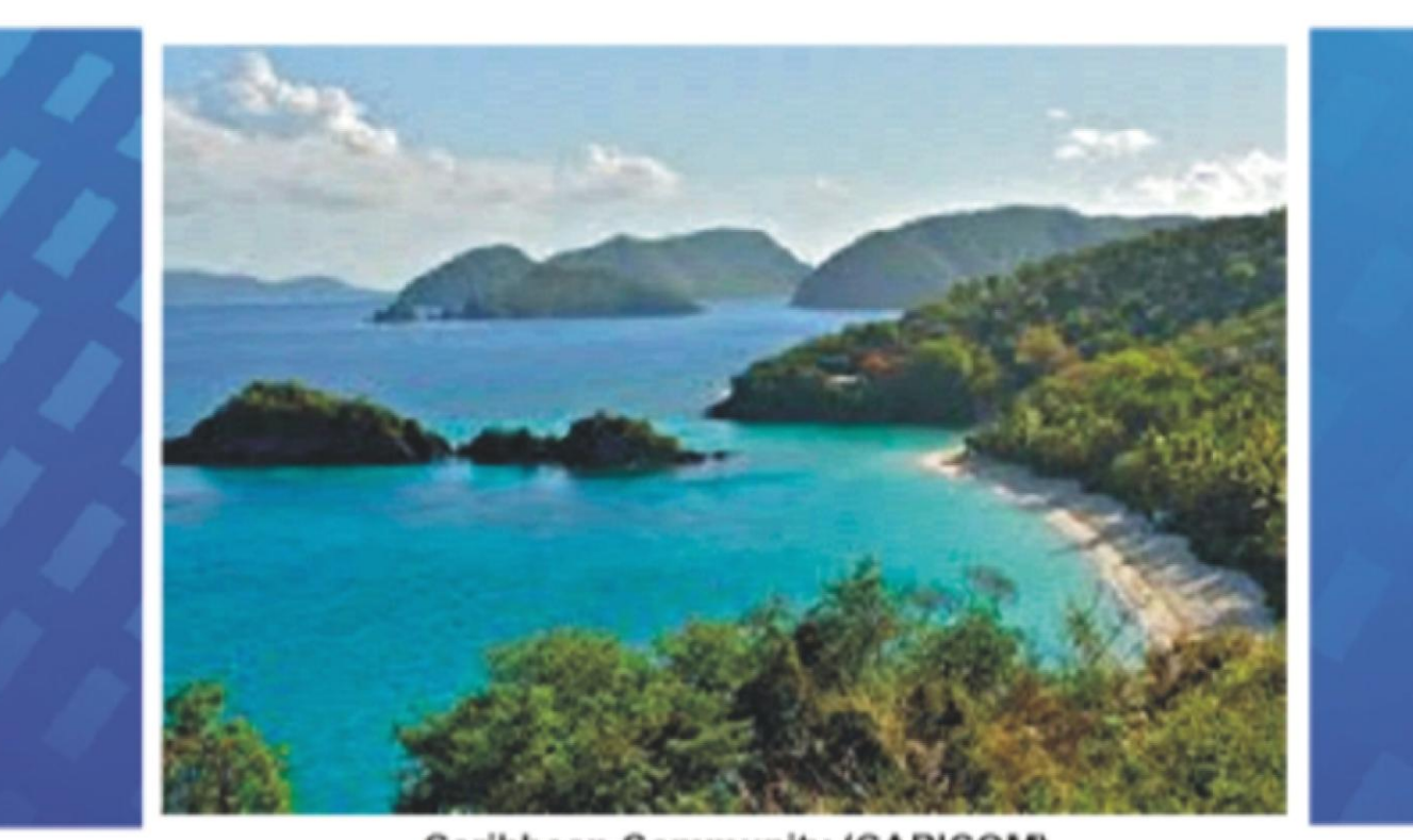
Caribbean Community (CARICOM) Pan Caribbean Partnership against HIV and AIDS (PANCAP)