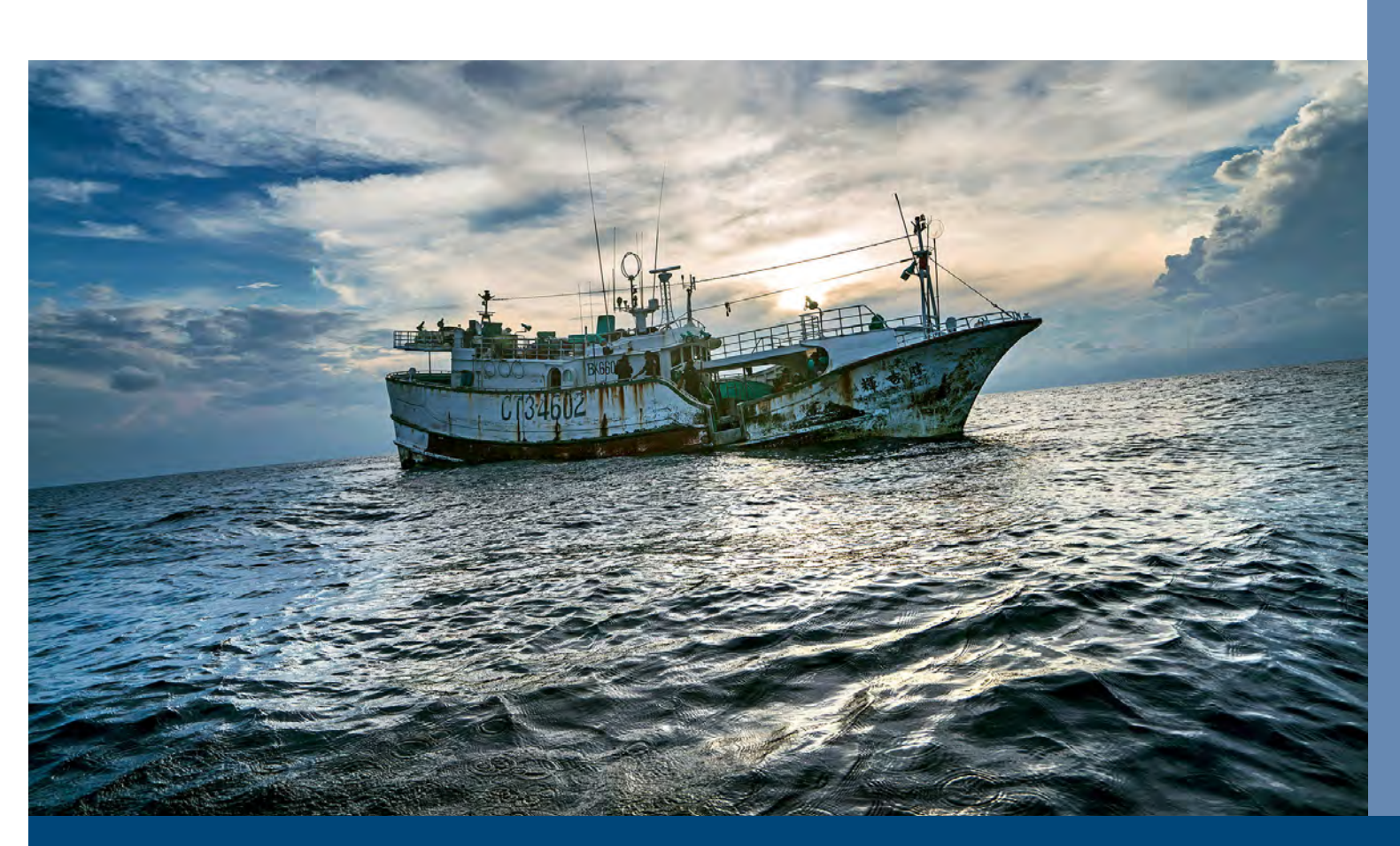
The Sheng Chi Huei 12, a Taiwanese fishing vessel. Photo: Benjamin Lowy/Reportage; The Outlaw Ocean, Ian Urbina, The New York Times