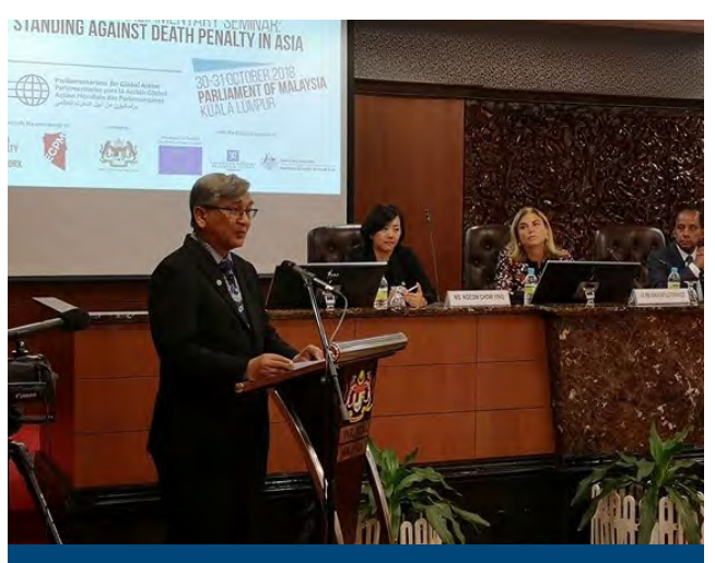
Malaysian Minister of Law, Hon. Liew Vui Keong, commits to advocating for full abolition in Malaysia

The activism of PGA members has successfully contributed to reducing the scope of the death penalty, abolishing it altogether, blocking its reintroduction or the resumption of executions, or ratifying relevant international instruments in