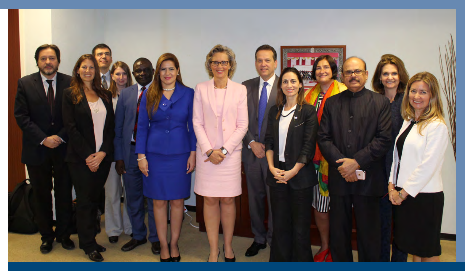
Fishing (IUU) and the Cape Town Agreement (CTA)

Spain has authorized the CTA in both Congress and the Senate and is currently pending the deposit of the instrument for ratification. Passed with overwhelming support in both chambers, PGA's letters have helped in generating a sense of urgency and support for this decision.