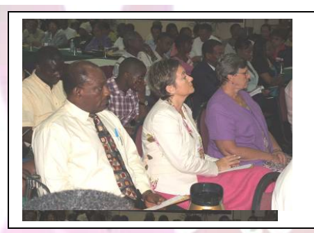
Champions for Change III